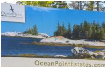
Mahone Bay Ocean frontage