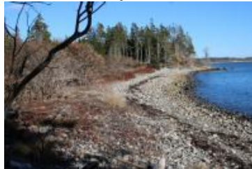
Land by the Sea