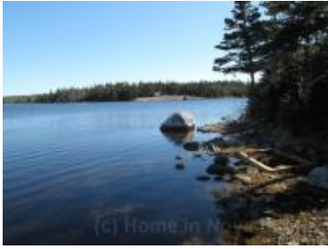
Upper Lakeville Grants $199,999