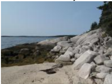
Ocean Point - Coastal Estates Community