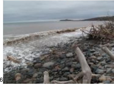
Lot Range Road Grand Desert $189,000

http://homesinnovascotia.com/properties/2099/ Bob Harris - bob@homesinnovascotia.com