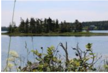
Lot 82 A & B Blue Grass Rd (Boutilliers Point Rd) Mushaboom NS $195,000

http://homesinnovascotia.com/properties/1090/ Bob Harris - bob@homesinnovascotia.com