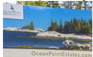
Lot 19-A Commodores Drive Aspotogan $135,000