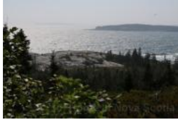
"Views of Mahone Bay