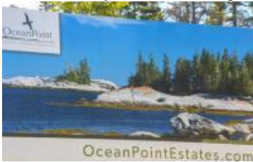
Mahone Bay Ocean frontage