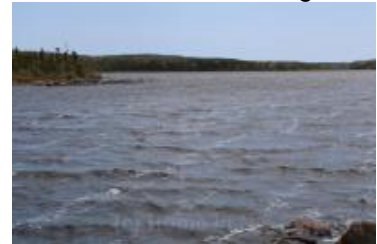
Private Lake Setting