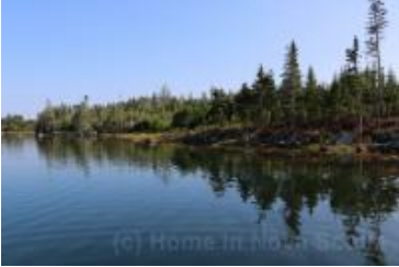
Ocean frontage Head Jeddore