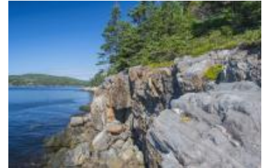
Mahone Bay Ocean frontage