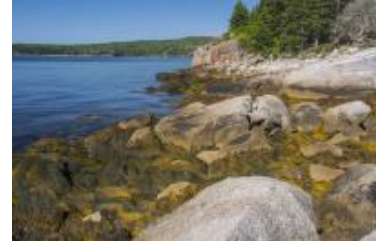
Mahone Bay Ocean frontage