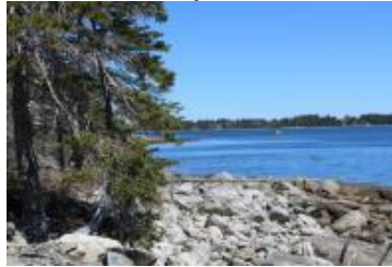
Home by the Sea