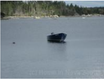
Home of the Blue Grass

34 Flat Point Road Clam Harbour $74,900 http://homesinnovascotia.com/properties/2130/