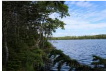
Great Fishing Lake