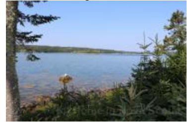
Ocean frontage Head Jeddore