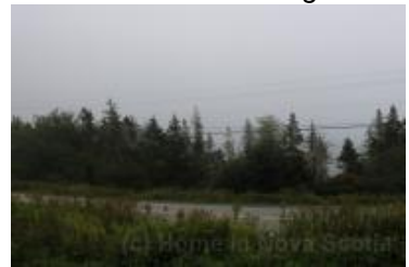
Ocean View Building Lot

1505132603 Lot A Highway 7 Spry Harbour $11,900 http://homesinnovascotia.com/properties/2146/ Bob Harris - bob@homesinnovascotia.com