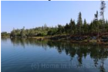
Ocean frontage Head Jeddore