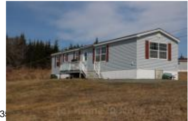
Home/Cottage next to Clam Harbour Beach