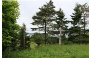
"Building lot with a view"

1531663384 1531761412 Parcel X-1 Cottage Cove Rd, Head Jeddore $45,000 http://homesinnovascotia.com/properties/2161/ Bob Harris - bob@homesinnovascotia.com