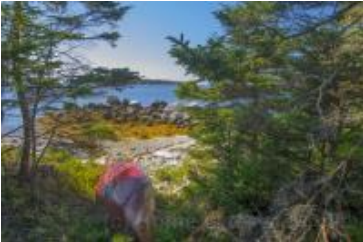
Mahone Bay Ocean frontage