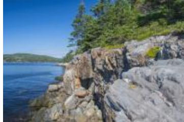
Mahone Bay Oceanfront